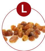
L sulphite/ sulphur dioxide