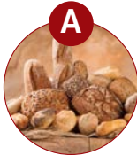
A cereals containing gluten